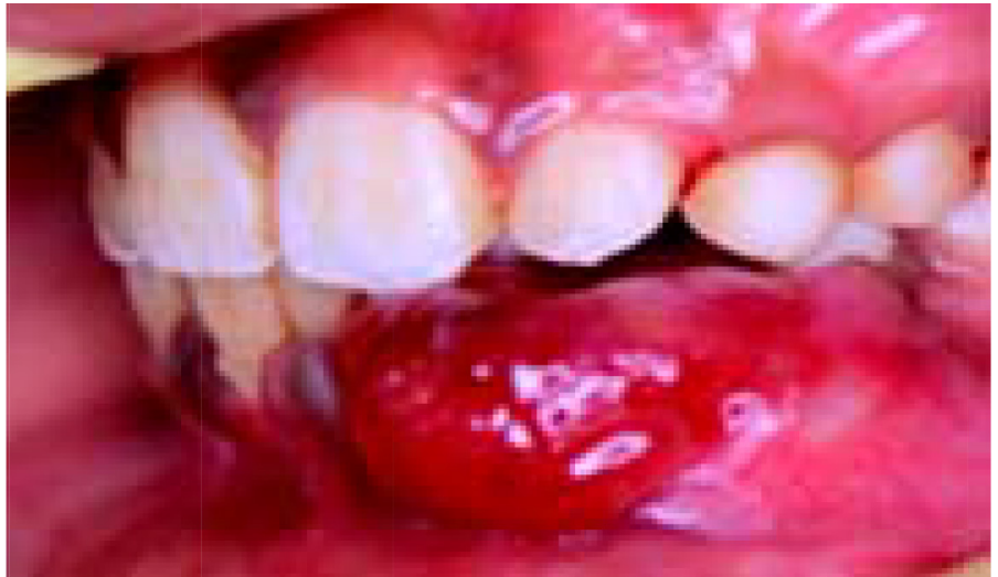
Fig 2: Intraoral Findings- A fiery red sessile lobulated gingival overgrowth.