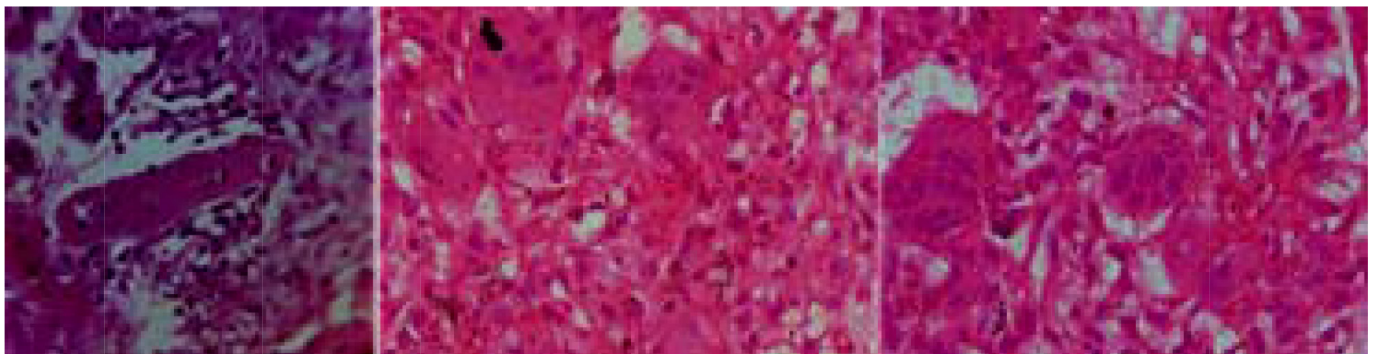
Fig 4: Numerous proliferating multinucleated giant cells within the background of plump ovoid and spindle-shaped mesenchymal cells, bony trabeculae, and many intervening congested blood vessels with foci of hemorrhage and inflammatory infiltrate (H and E, 10X and 40X)